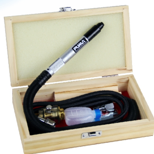
AT-3172 1/8" 60000rpm micro die grinder AT-3172M 3mm 60000rpm micro die grinder