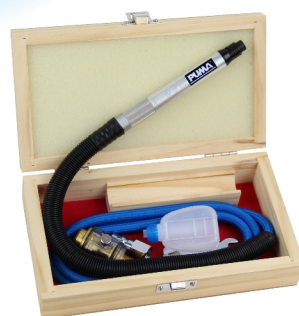
AT-3180 1/8" 70000rpm micro die grinder AT-3180M 3mm 70000rpm micro die grinder