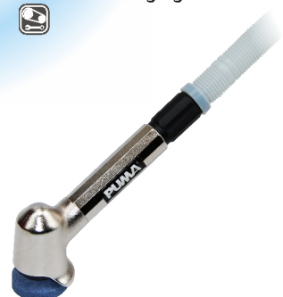
AT-3190 120° 30mm Air angle grinder