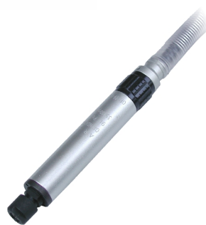
AT-7230 1/8" 70000 rpm micro die grinder AT-7230M 3mm 70000 rpm micro die grinder