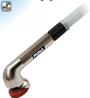
AT-3191 90° 30mm Air angle grinder