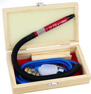
AT-3170 1/8" 54000rpm micro die grinder AT-3170M 3mm 54000 rpm micro die grinder