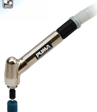
AT-3193 1/8" 120° Air angle die grinder AT-3193M 3mm 120° Air angle die grinder