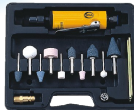
AT-7032K(MK) 1/4" (6mm) die grinder kit AT-7132K(MK) 1/4" (6mm) die grinder kit