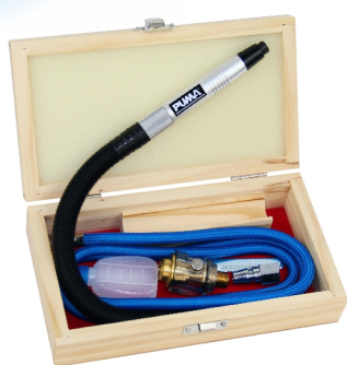
AT-3181 1/8" 70000 rpm micro die grinder AT-3181M 3mm 70000 rpm micro die grinder