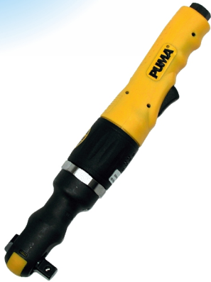
AT-5158 3/8" Air ratchet wrench