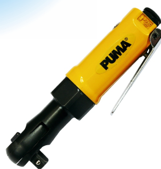
AT-5257 3/8" Air ratchet wrench