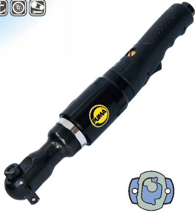
AT-5353 1/2" Air impact ratchet wrench