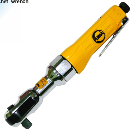
AT-5057 1/2" Air ratchet wrench