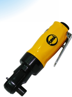
AT-5251 3/8" Air ratchet wrench