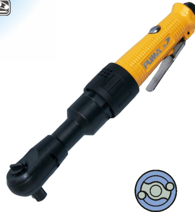
AT-5351 1/2" Air impact ratchet wrench