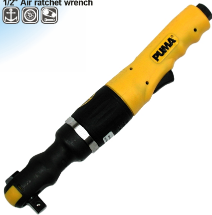
AT-5159 1/2" Air ratchet wrench