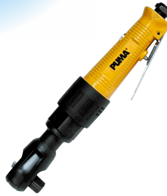
AT-5252 3/8" Air ratchet wrench