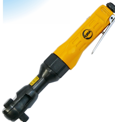
AT-5053 1/2" Air ratchet wrench