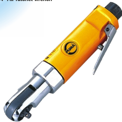
AT-5055 1/4" Air ratchet wrench