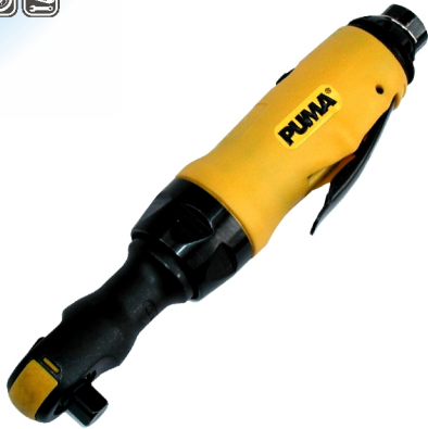
AT-5152 1/4" Air ratchet wrench