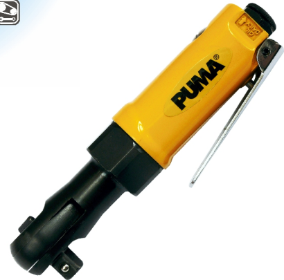
AT-5256 1/4" Air ratchet wrench