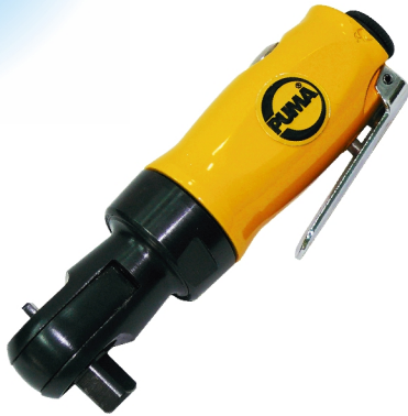
AT-5250 1/4" Air ratchet wrench