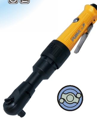
AT-5350 3/8" Air impact ratchet wrench