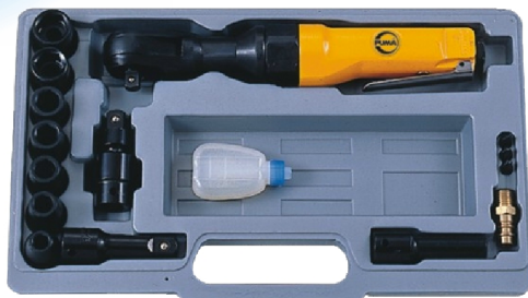
AT-5001 17 pcs 3/8" Air ratchet wrench kit AT-5002 17 pcs 1/2" Air ratchet wrench kit