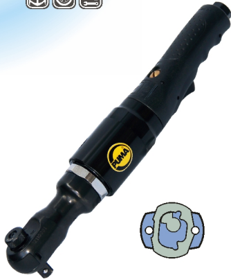
AT-5352 3/8" Air impact ratchet wrench