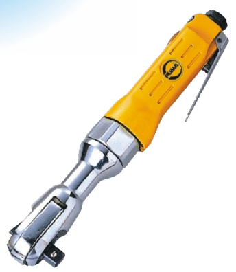
AT-5056 3/8" Air ratchet wrench