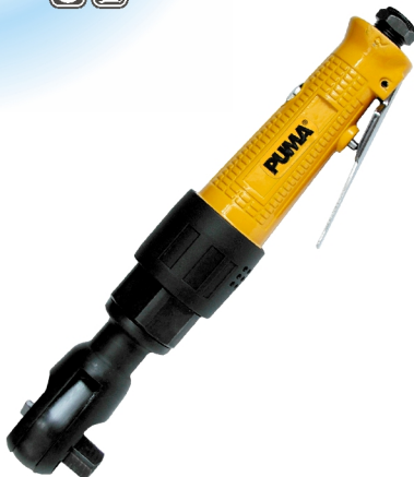
AT-5253 1/2" Air ratchet wrench