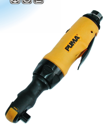
AT-5153 3/8" Air ratchet wrench